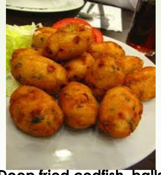
Deep fried codfish balls