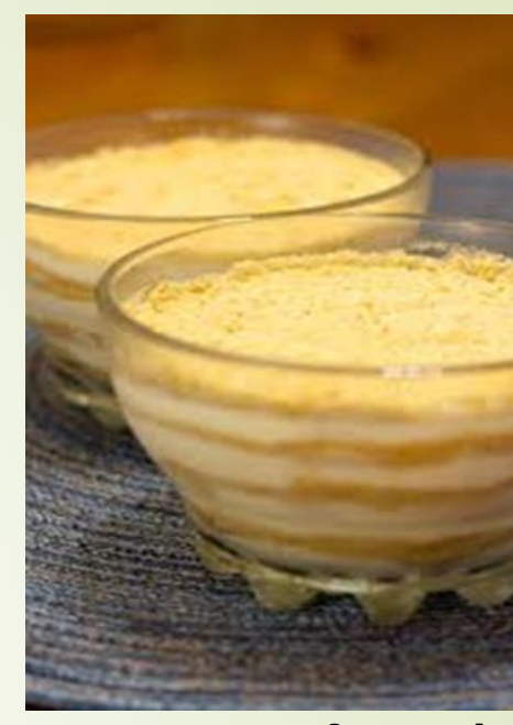
Biscuit mousse Serradura Macau Pudding