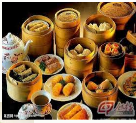
Pop chop bun