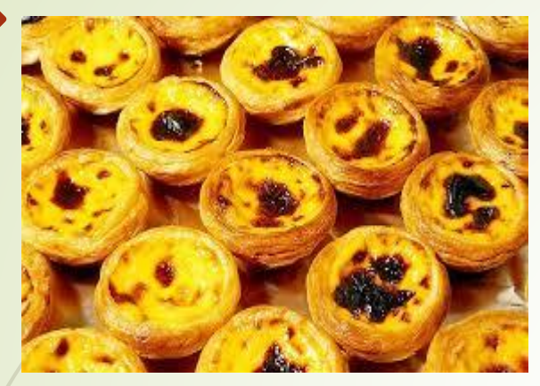
Portuguese egg tarts