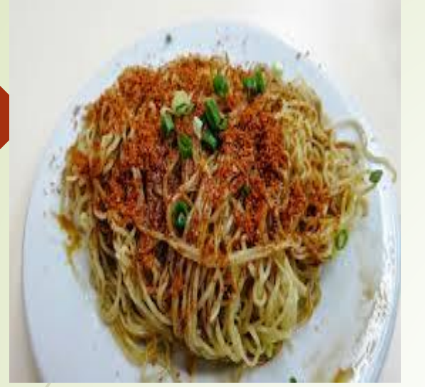
Noodles with sauce